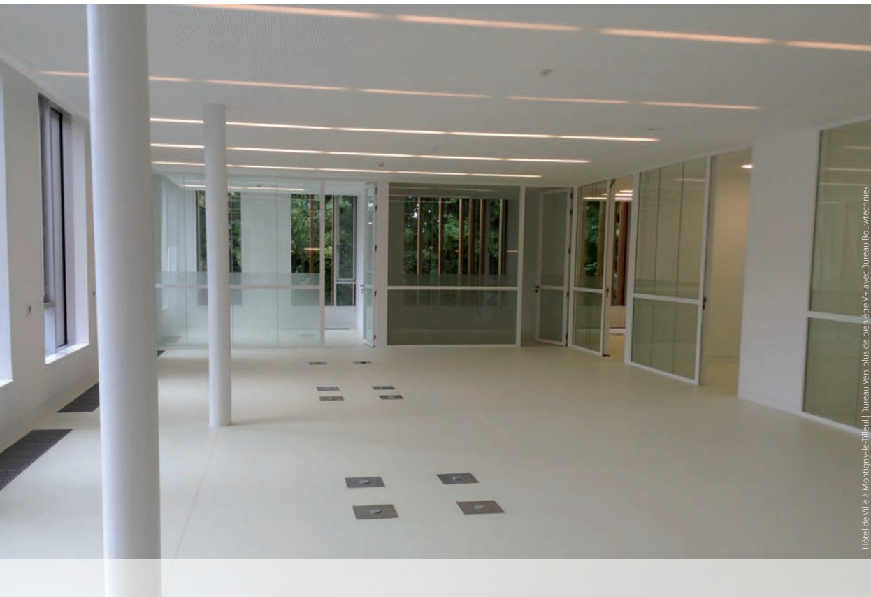
Hôtel de Ville à Montigny-Le-Tilleul | Bureau Verts plus de bien-être -> avec Bureau BOUTRECHNIK