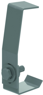
Cover clamp for HDKLIE DKI