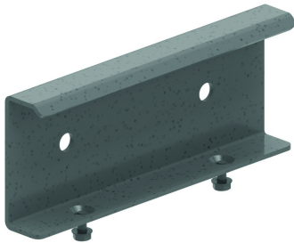
Joiner for HDKLIE HDLVIE