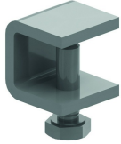
Cover clamp for KLL KLLDK