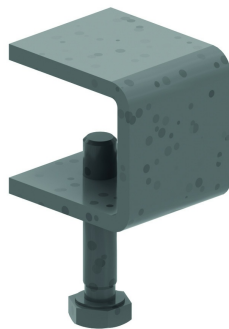
Cover clamp ZMDKIG

Covers with width > 400 mm are delivered with diagonal reinforcements.