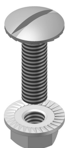
Toothed round head bolt / flange nut VM