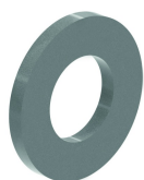
Giant washer (DIN 125-1 A) RO