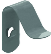
Cover clamp clips DCL