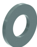
Giant washer (DIN 125-1 A) I6RO