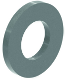
Giant washer (DIN 125-1 A) I6RO