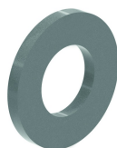
Rondelle (DIN 125-1 A) I6RO