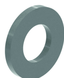
Rondelle (DIN 125-1 A) I6RO

Nombre minimal des boulons et des écrous: 8 pièces.