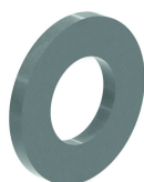
Sluitring (DIN 125-1 A) I6RO